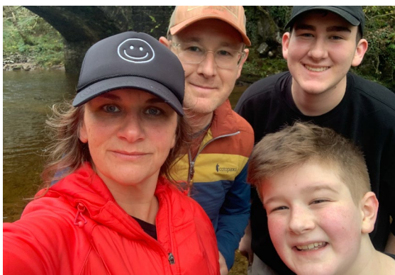
Waterfall country, Ystradfellte